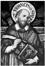
St. Francis de Sales Patron of Authors

By now you have probably read some of the wonderful articles in our parish bulletin. What you may not be aware of is that it takes many volunteers submitting articles in order for us to put together the bulletin each week. As such, we are always looking for new volunteers to join our ranks.